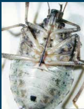
Underside of adult insect.