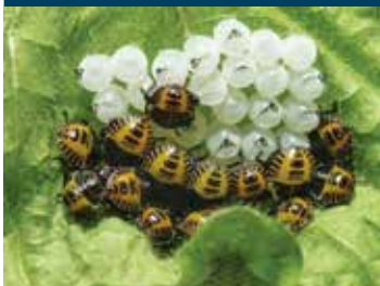
Eggs with emerging nymph stage insects.