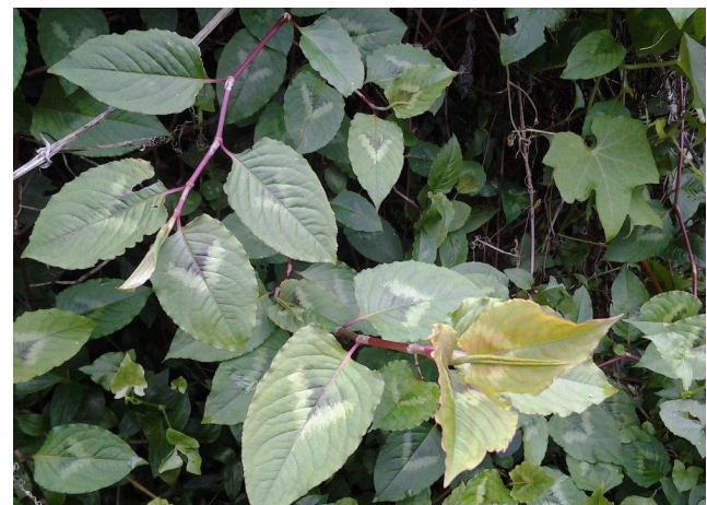
Distinct V-shaped blotches on leaves.