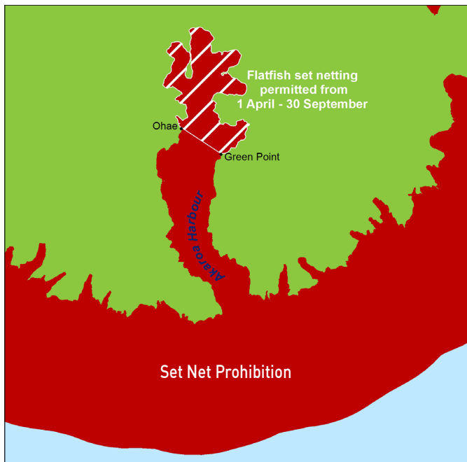
Map 3: Flatfish set netting area within the Akaroa Taiāpure.